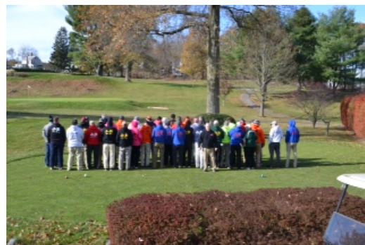
Golfers all wearing J & B Auto Body Hoodie Sweatshirts